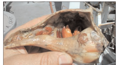
Porcelain crabs, Giant Red Hermit Crabs and Lightning Whelk