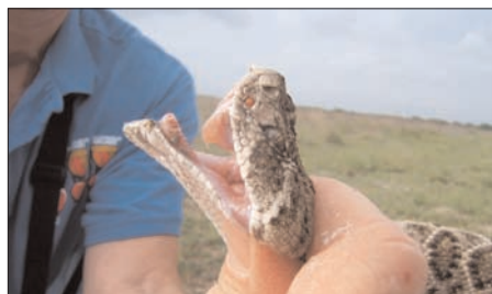
Rattlesnake at Welder Wildlife Refuge

Eastfield College is offering a Field Studies Program to the Texas Gulf Coast (Port Aransas) May 12 – 22. The Texas Gulf Coast Program includes Environmental Biology 2406