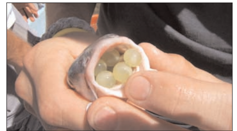
Catfish with incubating eggs in its mouth