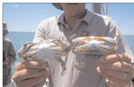
Male & female blue crabs