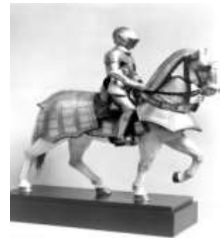
Armor for Knight and Horse , Italian, ca. 1575. Metropolitan Museum of Art

Biographical notes of Charlemagne, William the Conqueror, Richard the Lion-Hearted and King Henry V are highlighted. Also included are King Arthur, Roland, Sir Gawain, and The Red Crosse Knight. The influence of the Christian Saints such as St. George, St. Joan, and Santiago is explained. On loan from Humanities Texas , a partner of the National Endowment of the Arts and made possible with a grant from Student Life , The Art of Chivalry is sure to please one and all.